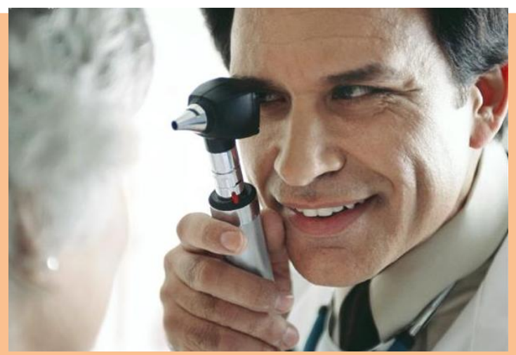
Glaucoma Detection Program